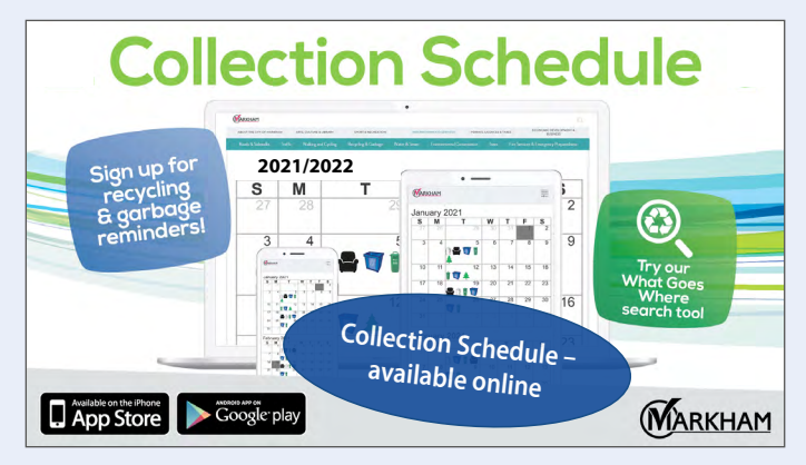
You can find your schedule at markham.ca/ Recycling & Garbage

The only outdoor burning that is permitted in a typical subdivision, without a permit, is a fuel-fired appliance that is designed for the outdoors (propane or natural gas fired such as a BBQ), that is regulated by TSSA and installed by a licensed contractor.