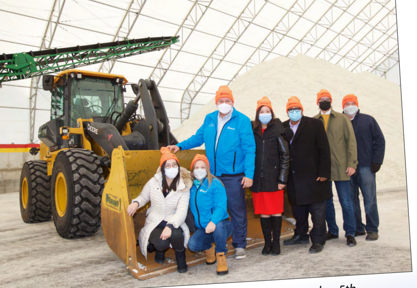
New Ninth Line works yard opened on November 5th