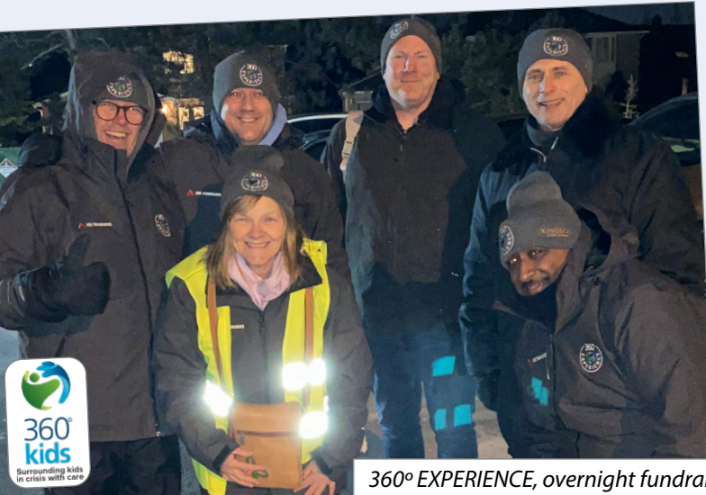
360° EXPERIENCE, overnight fundraiser, March 3, 2022

Main St. has become a thoroughfare for traffic and a resolution is needed to reduce the amount of traffic and speed on the street. A secondary plan for the development of Mount Joy has not yet been finalized but the area will see significant density and Main St. could see increased traffic south of 16th Avenue. As part of our comprehensive multi-year road safety strategy, Main St. was identified in the capital budget and funds were approved in our 2022 budget to identify an appropriate solution to addressing speed mitigation between 16th Avenue and Bullock Drive. The feasibility study and consultation will likely occur in 2023.