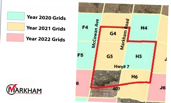
The above map shows the timing of the block pruning within ward 4. The areas with the highest number of complaints from residents, will be done first and we are hoping to have these areas completed by the end of 2021.