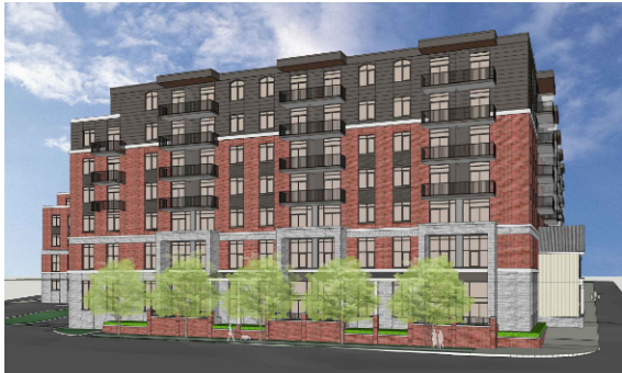
East Elevation on Water Street (7 storeys due to grade)